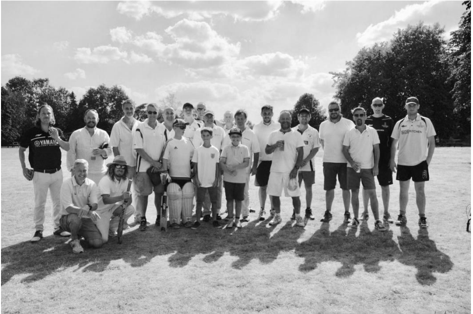
The Memorial Cricket Match line up, 15 July 2018