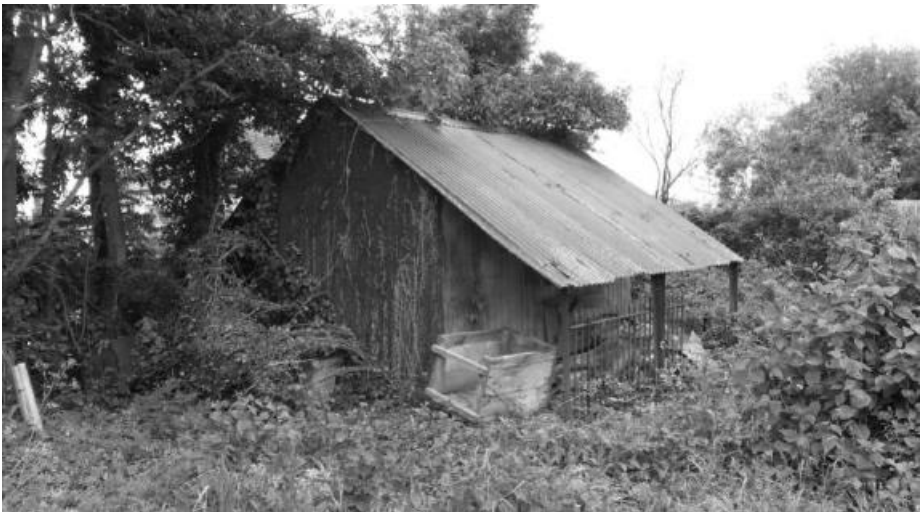
The hovel on the Heritage Trust land in Cleeve Prior

The main aim of the project is to record and share the memories and buildings related to market gardening before this heritage is lost. A survey of surviving market gardening sheds (locally known as hovels) is already underway, so we are currently looking for help with the archival research and oral history strands of the project. Whilst some research has been carried out into market gardening within the Vale, particularly in Badsey, there are many more communities, families and related industries with untold stories.