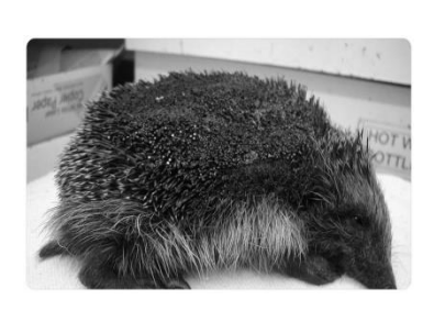
Burnt hedgehog, Longstanding local bonfire above

Thank you to those who attended my Nature & Wildlife Talk in February. One of my presentation slides was about sparing a thought f or overwintering Hedgehogs that may be hibernating in long-standing built fires. Once they awake in April, they can then go on to use the same location as a nest to give birth to their Hoglets, from June through to September. Many Hedgehogs are killed by bonfires, long-