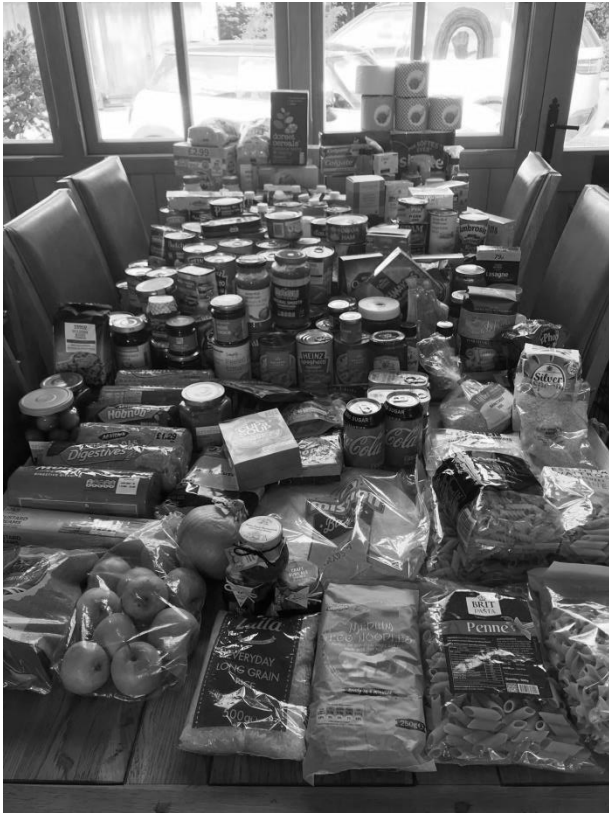
The collection for Pershore Food Bank, May 2020