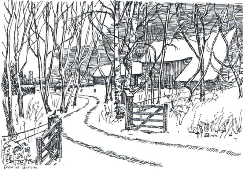
Field Barn, looking towards Evesham Road and St.Andrew's Church