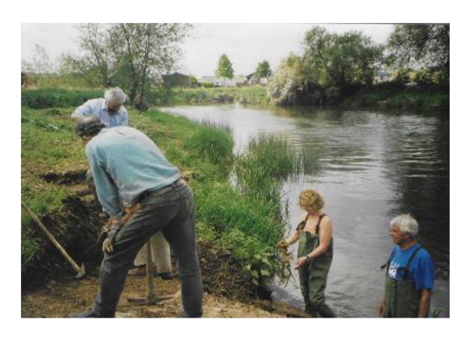
An area of the old weir face was exposed