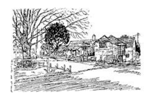
So the clear up began again