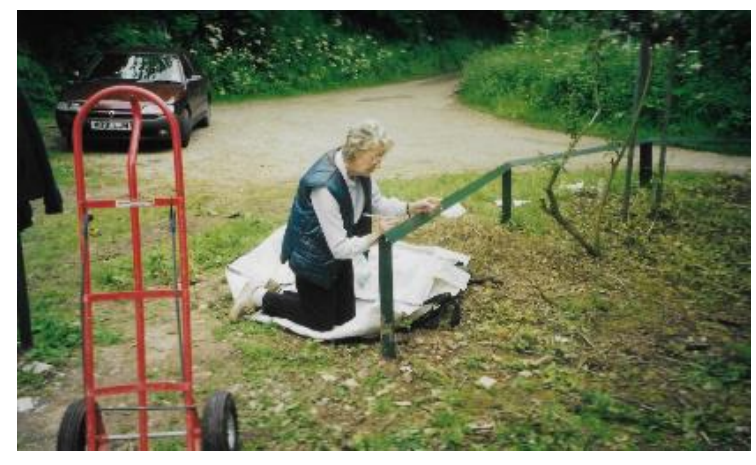
Fencing was repaired and the facilities improved