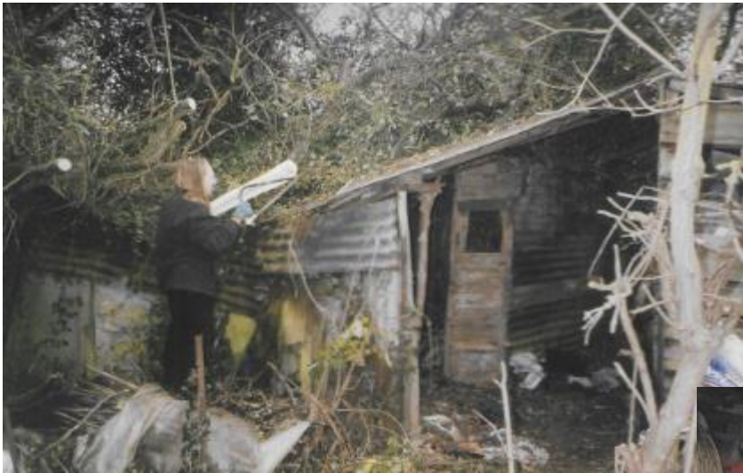
Reg Taylors Hovels Boobys Close