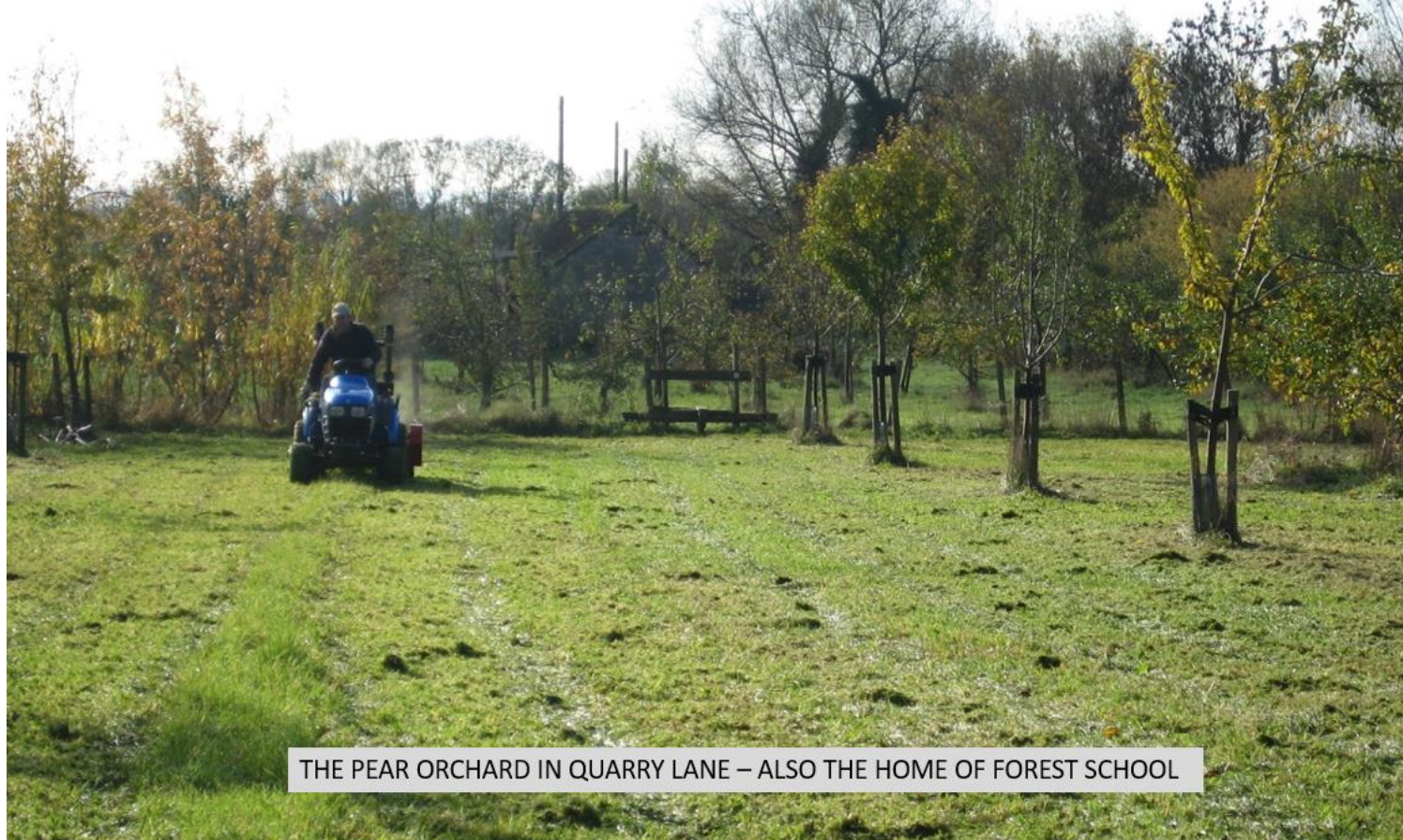
THE PEAR ORCHARD IN QUARRY LANE – ALSO THE HOME OF FOREST SCHOOL