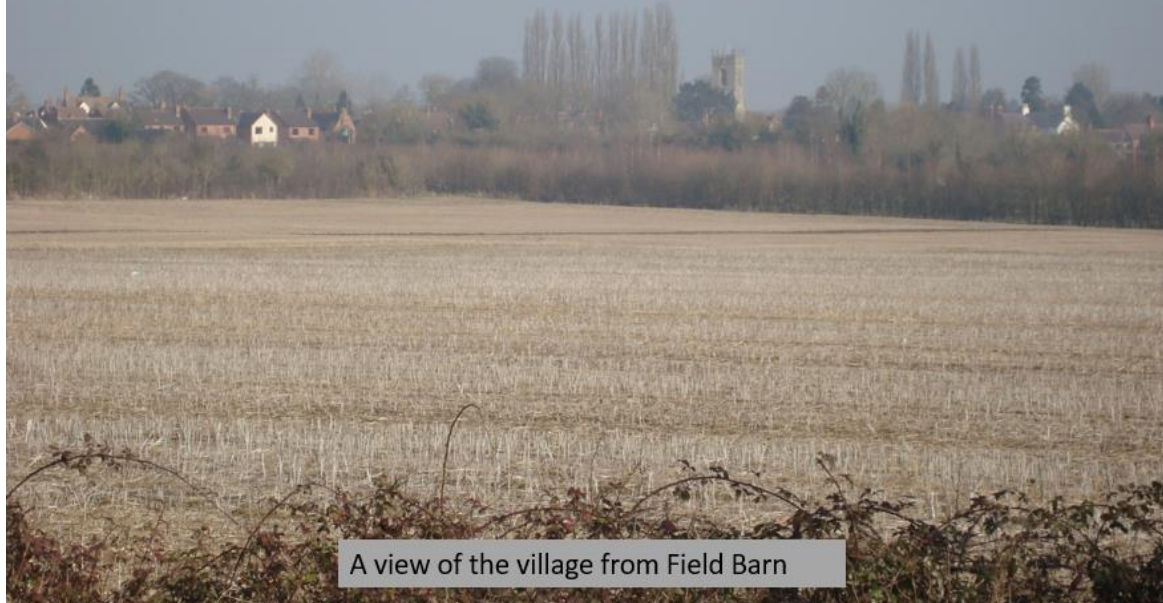
A view of the village from Field Barn

The Cleeve Prior Heritage Trust looks after 27 acres (11 ha) of old pasture, traditional orchards, woodland and ponds that have been acquired by the village over the years. A Charitable Trust started in 1997, it is based in the Grade II listed Field Barn. Local volunteers meet every Tuesday from 10.00am until 1.00pm. During that time we carry out a wide variety of jobs depending on the time of the year. From time to time we also undertake projects in order to maintain and develop the asset's. We also organise events at specific times of the year to raise funds whilst at the same time bringing our local community together