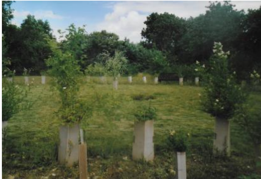
Boobys Close 2007